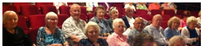
ILU & ALU residents waiting for Nunsense to begin

ILU and ALU residents attended the first play of the Mac-Haydn Theatre 2012 season. We saw Nunsense and it was terrific! Before the performance we had a delicious lunch at Winding Brook Country Club. We have tickets for Oliver , Brigadoon , Legally Blonde , Kiss Me Kate , Copacabana , State Fair & Smokey Joe's Café and can't wait to see them all!